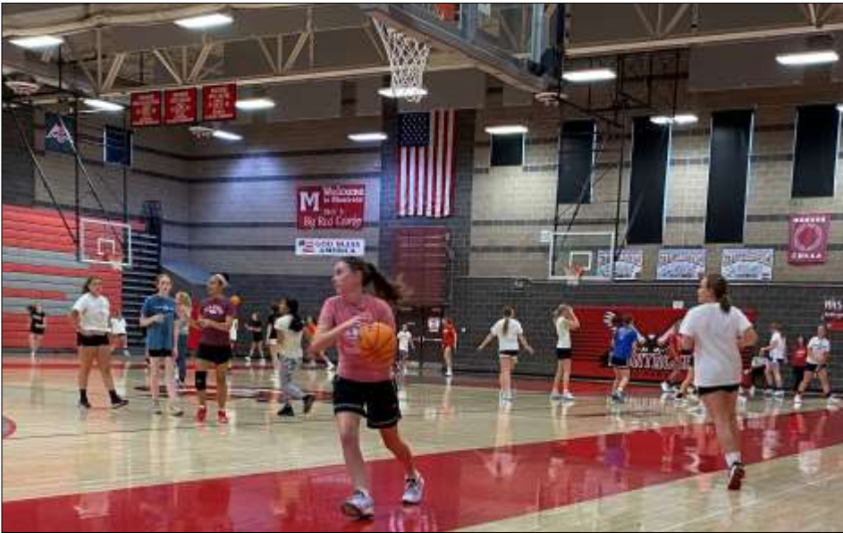
MHS girls trying out for the varsity, junior varsity and freshmen basketball teams.