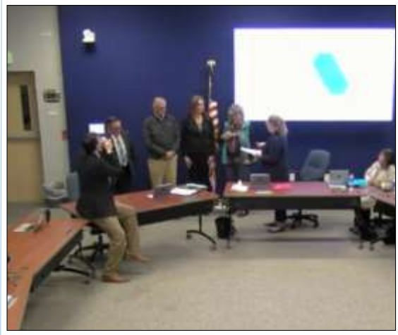
Newly elected directors of the Montrose County RE-1J Board of Education were sworn in on Tuesday, Nov. 28.