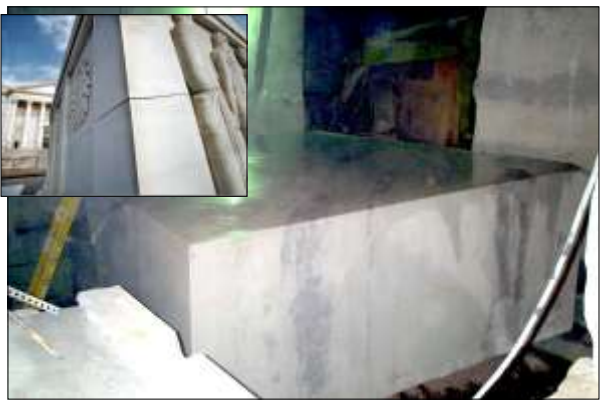
Replacement block: During a tour of the Yule Quarry in 2003 visitors looked at a block of marble that, at the time, was planned for sculpting and replacement of the monument at the Tomb of the Unknowns in Arlington National Cemetery. Inset: The crack in the monument.