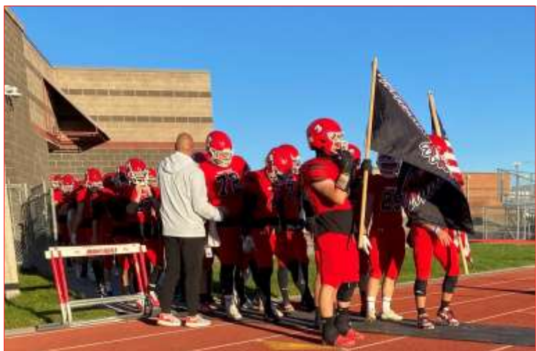
Red Hawks set to take the field on Friday night to take on the Coronado Cougars.