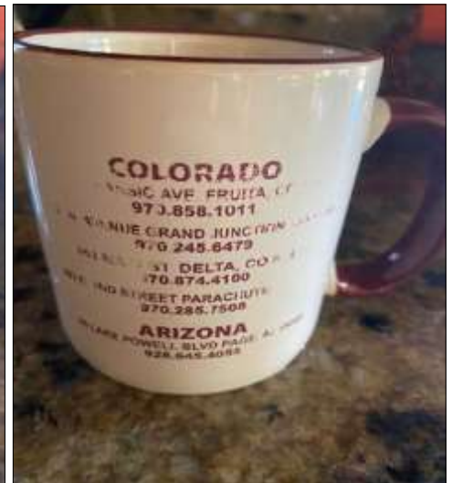
The El Tapatio mug gracing the counters of Western Colorado is a sweet memory for all those uninitiated folks who say, "Yeah - we'll take the big one."

work gloves and beanies and carharts that smelled of linseed oil and campfire smoke. We had been working all day and we were spent. He was similarly smelly and chilly and tired.