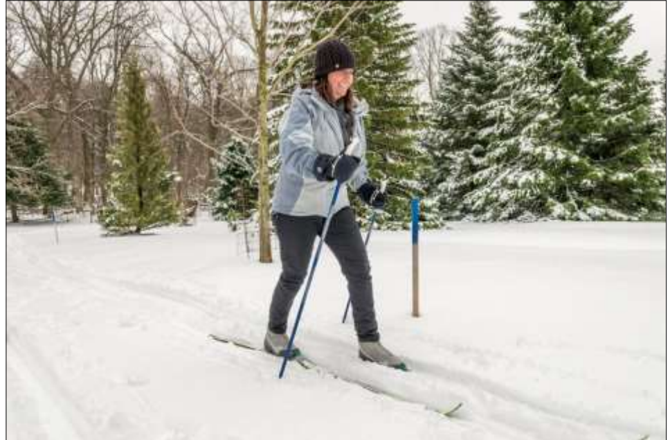
Happy Friluftsliv lady.

For SAD inclined folks, winter lighting indoors is problematic. The brightness or intensity of light is measured in lumens. For example, when you are indoors, most artificial light is around 400 to 600 lumens.